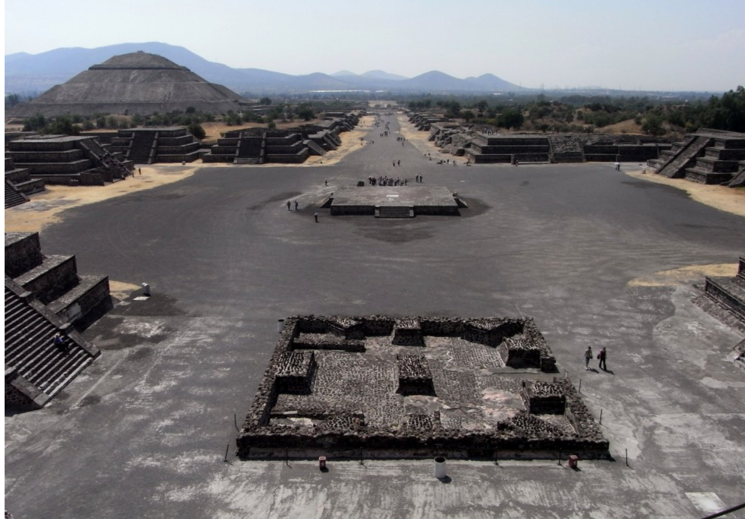
AVENUE OF THE DEAD The ancient city's main street was once lined with fine temples.

About 50 kilometers north of Mexico City are the ruins of Teotihuacan, once, historians