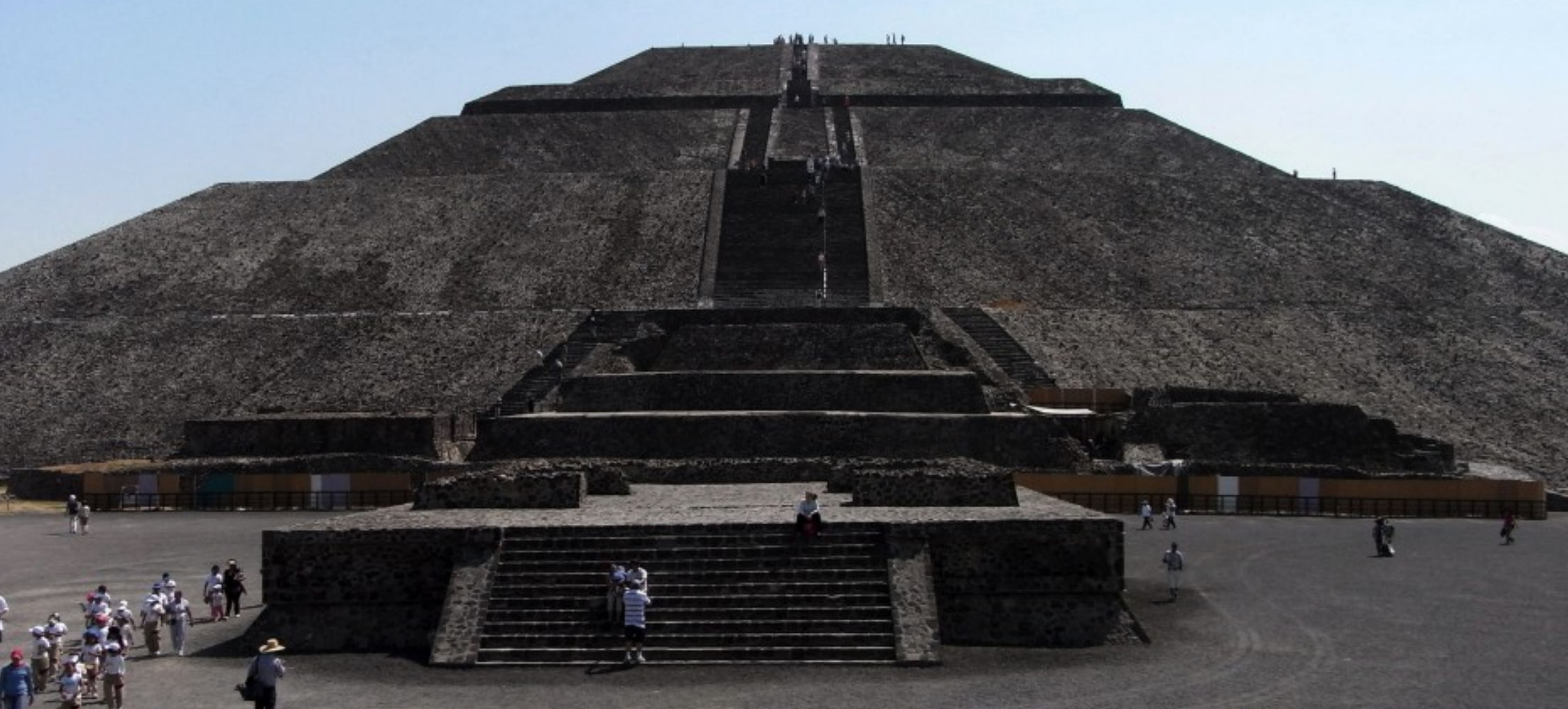
PYRAMID OF THE SUN The highest of the city's pyramids is the Pyramid of the Sun. Climbing it is quite exhausting.

unrest, that caused an uprising in Teotihuacan, the poorest residents of the city's outskirts burning the palaces of the wealthy in the city centre. Or, alternatively, Teotihuacan was invaded and its residents slaughtered. But by whom?