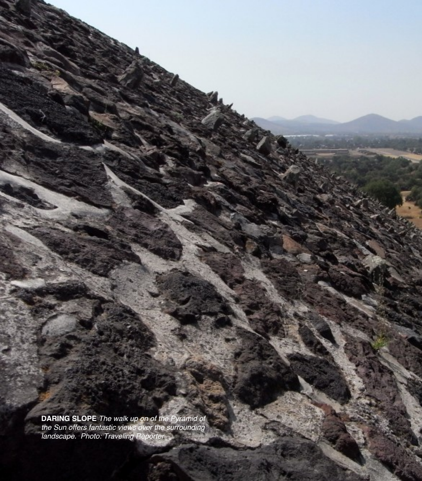
DARING SLOPE The walk up on of the Pyramid of the Sun offers fantastic views over the surrounding landscape.

plastic Maya statues swarm the place, as is the case with any major tourist attraction. But that shouldn't stop you from visiting Teotihuacán, as this ancient city holds some of history's largest secrets. Why was it ever built? What was its purpose? Why was it burned and abandoned?